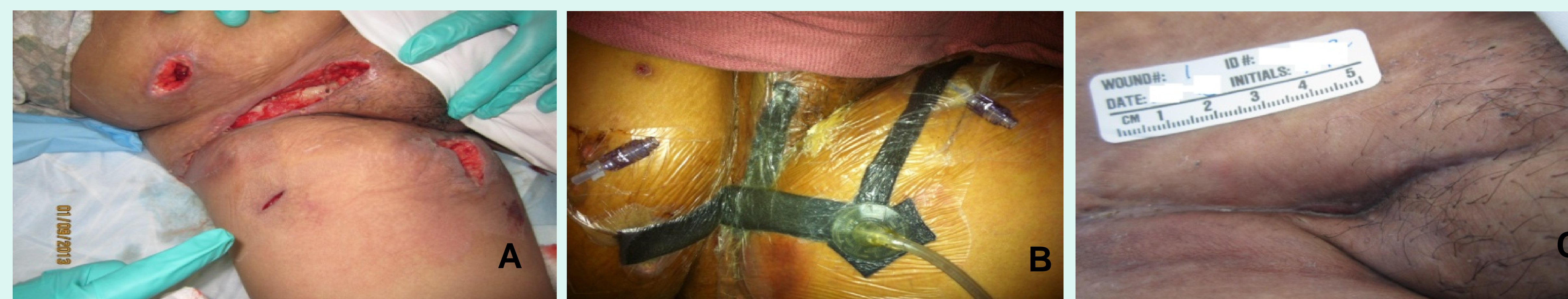
Figure 3. A: 41-year-old patient with NF of the lower abdomen and right upper thigh. Multiple small incisions were used without removing infected fascia, just suctioning out necrotic subcutaneous tissue. B: Instill VAC irrigation was conducted through multiple ports. C: The result was far less scarring with less pain and more rapid healing.