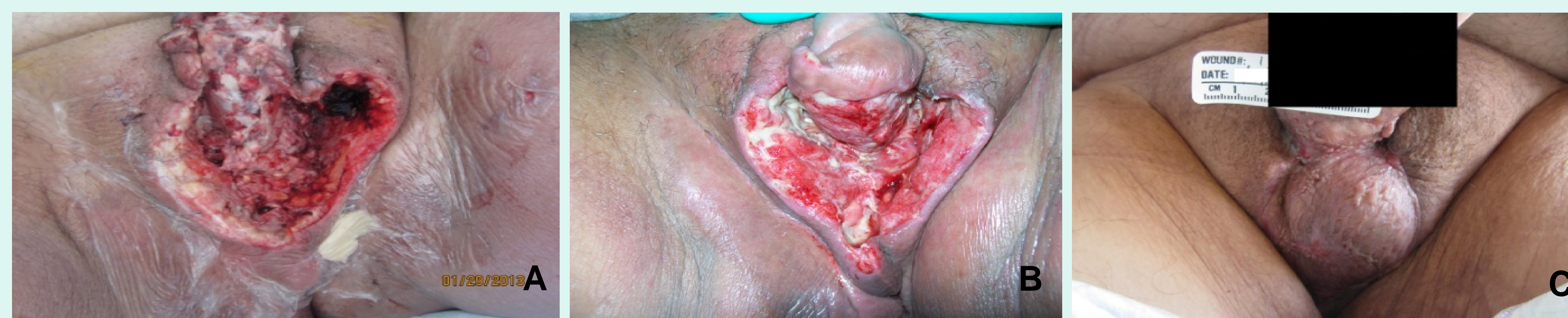
Figure 4. A: 54-year-old patient with abrupt onset of Fournier's gangrene. B: Immediate incision and drainage was performed removing the necrotic skin of the scrotum and penile base followed by instill vac with NeutroPhase® C: Within 2 weeks the thigh stored testicles and cord were surgically freed and eventually healed within one month with a split-thickness skin graft.