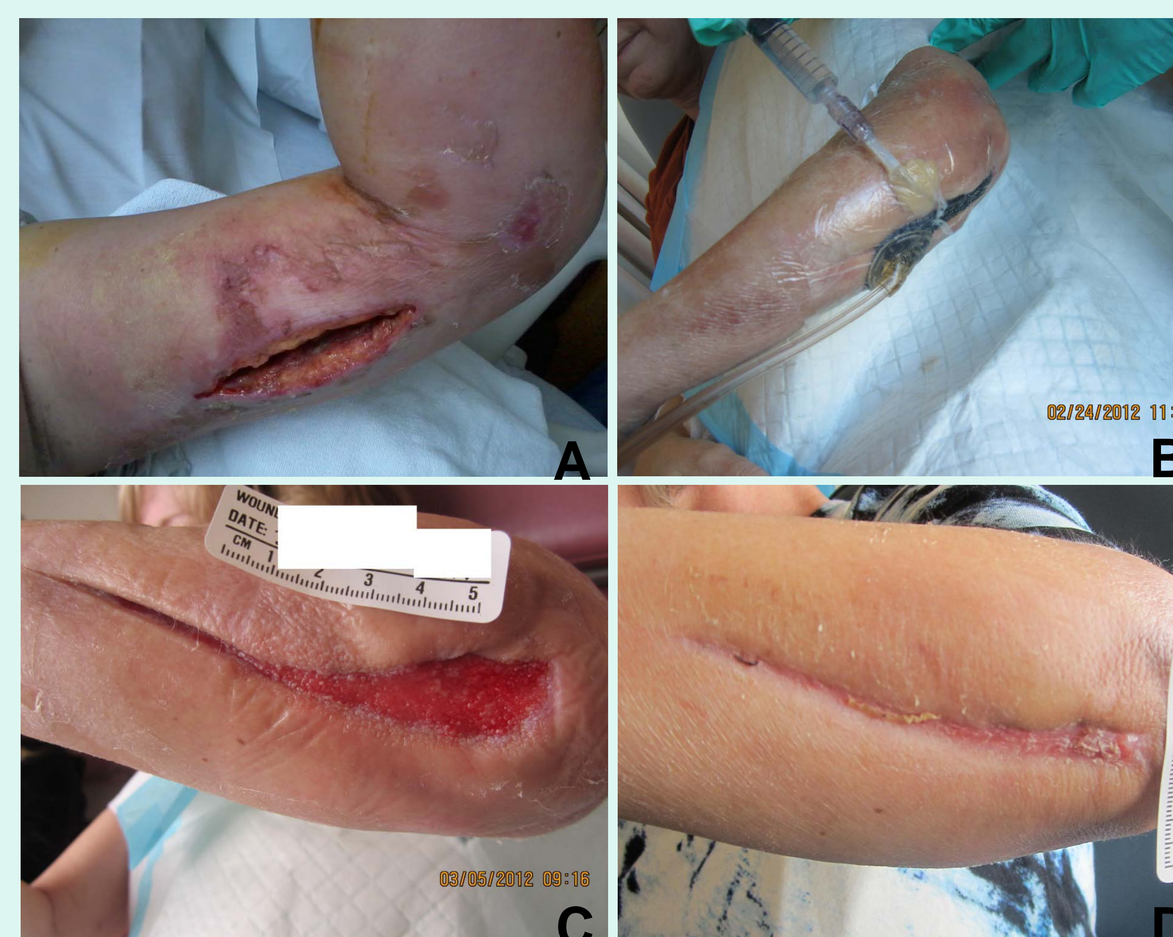
Figure 2. A: 51-year-old patient with NF in the arm. B: NeutroPhase® was instilled along with limited incision and only open drainage into a sponge. C: The wound quickly changed to regenerative stage and D: healed.