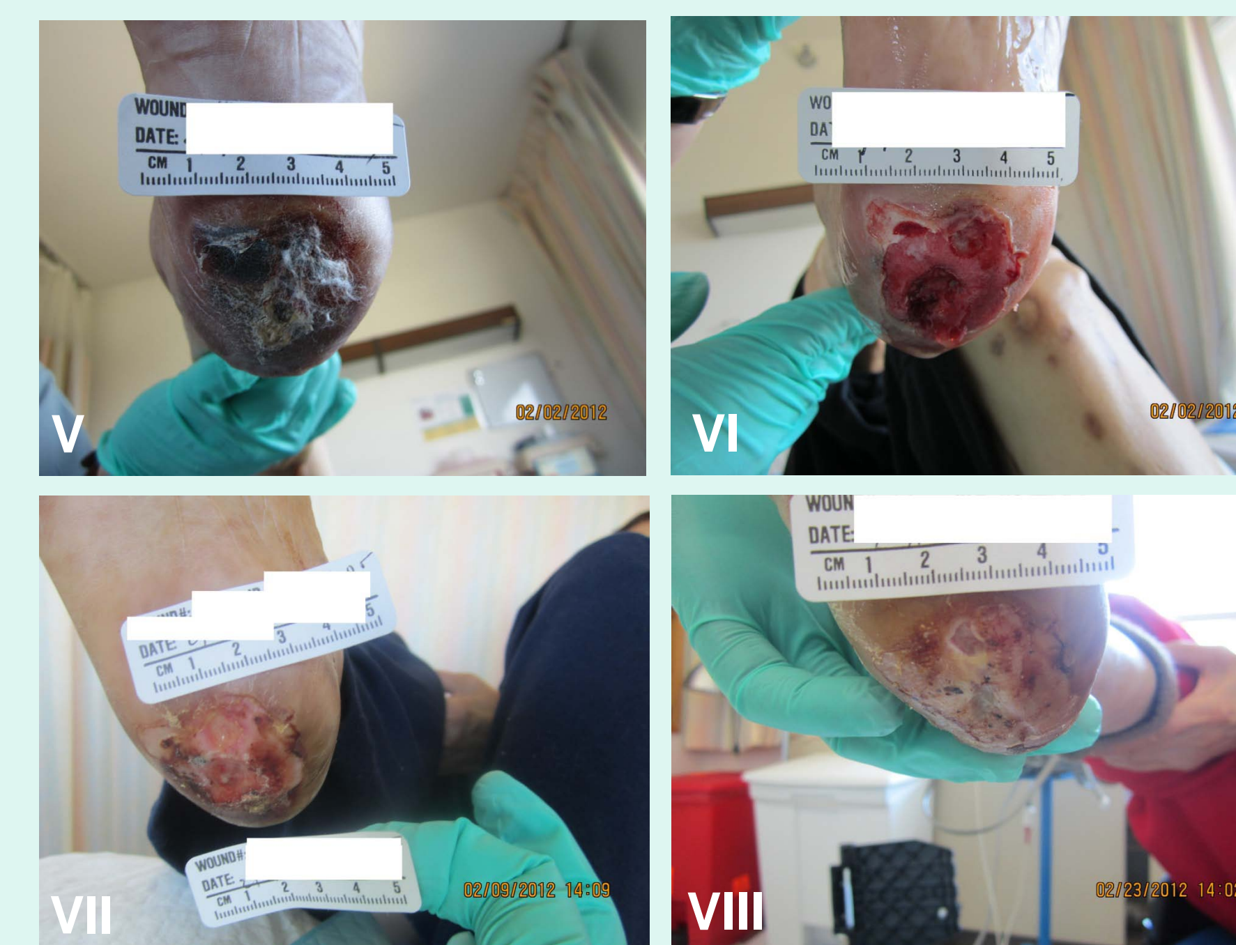
Figure 2. (V) 75 year old female with DM II, End-Stage renal disease presents to wound center with chronic ulcer on the right foot. (VI) Wound post-debridement. (VII) 1 week post-debridement. (VIII) Week 2 of treatment: Patient continues to heal and is now ready for biological skin equivalent to be applied.