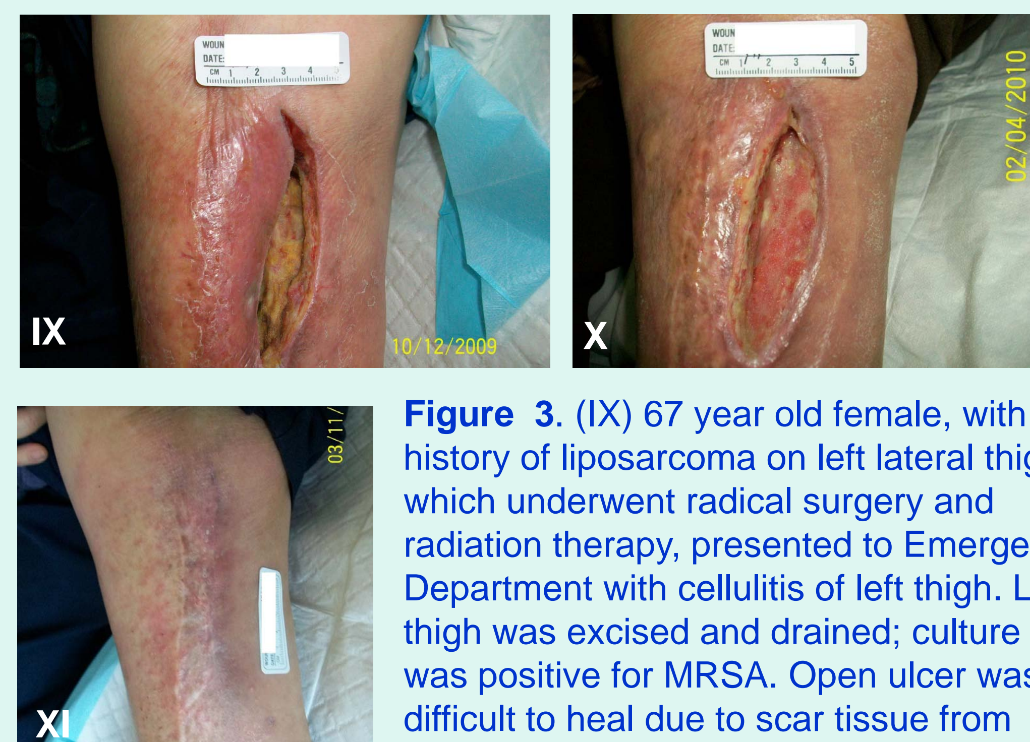
Figure 3. (IX) 67 year old female, with history of liposarcoma on left lateral thigh which underwent radical surgery and radiation therapy, presented to Emergency Department with cellulitis of left thigh. Left thigh was excised and drained; culture taken was positive for MRSA. Open ulcer was difficult to heal due to scar tissue from radiation therapy and MRSA infection. (X) With serial debridement of non-viable tissue and negative pressure wound therapy with HOCl 0.01% instill, wound is now healing evidenced by granulation tissue formation filling in the cavity. (XI) When adequate granulation was achieved and no sign and symptoms of infection, plastic surgery was consulted for flap closure of the wound.