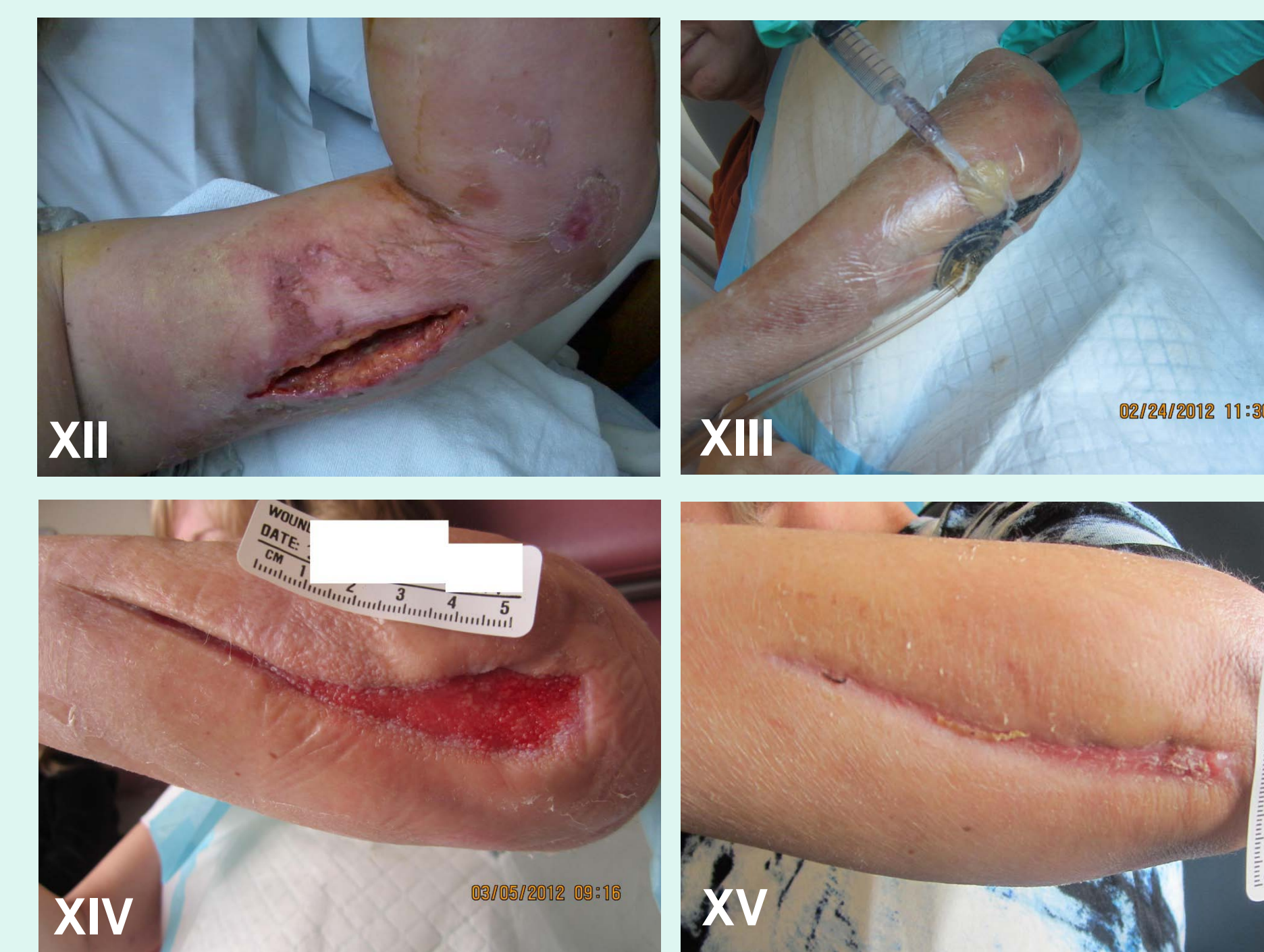
Figure 4. (XII, XIII, XIV, XV) This 51 y/o fell bruising left arm in a parking lot. Three days later arm flared up with streptococcal cellulitis and fasciitis. She went into shock and was admitted to ICU. Incision and Drainage (I and D) one day later followed by repeat lower arm I and D with VAC and instillation of NeutroPhase ® three times a day. Repeat extension of surgery in forearm. Discharged on VAC and instillation at home 3 1/2 weeks later, now @ 5 weeks upper arm healed and lower arm @ 90% with biological graft in place. No positive cultures obtained, just gram stain streptococcus found.